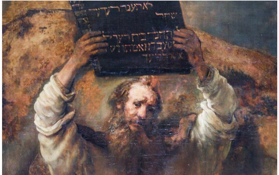
Moses Breaking the Tablets of the Law by Rembrandt, 1659